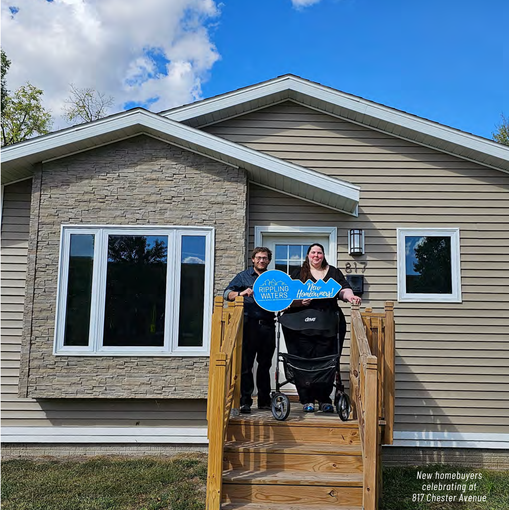
New homebuyers celebrating at 817 Chester Avenue